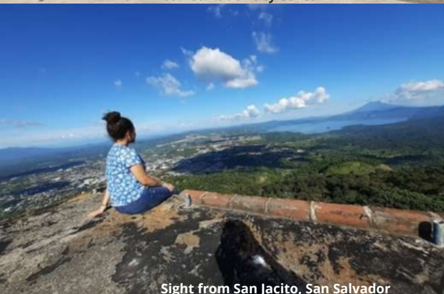
Sight from San Jacito, San Salvador